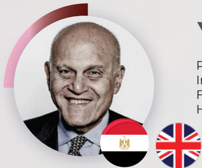
Yacoub, Sir Magdi

Professor of Cardiothoracic Surgery Imperial College London & Founder of Magdi Yacoub Heart Foundation